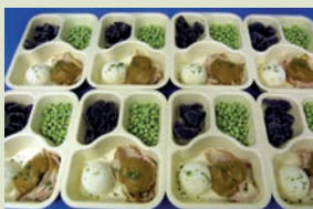
Meals are packaged in bio-degradeable containers