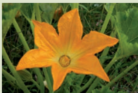
Zucchini used in our chicken soup