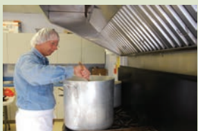
Flavourful gravies & sauces enhanced with rich reduced stock

At Valley Home Meals, we prepare home cooked, nutritious meals based on Canada's Food Guide for healthy eating. We work with a registered Dietician & Nutritionist to provide outstanding nutritional value to our customers.