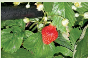
Strawberries for use in our baking

At Valley Home Meals, we grow our own seasonal fruits, berries and vegetables. We supplement by supporting local growers to ensure the best nutritional value and flavour in our menu items. Only the highest quality ingredients go into your meals. We make everything from scratch without using any pre-packaged mixes. MSG and Preservative Free.