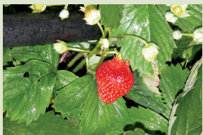
Strawberries for use in our baking

At Valley Home Meals, we grow our own seasonal fruits, berries and vegetables. We supplement by supporting local growers to ensure the best nutritional value and flavour in our menu items. Only the highest quality ingredients go into your meals. We make everything from scratch without using any pre-packaged mixes. MSG and Preservative Free.