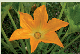
Zucchini used in our chicken soup