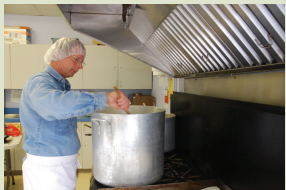
Flavourful gravies & sauces enhanced with rich reduced stock

At Valley Home Meals, we prepare home cooked, nutritious meals based on Canada's Food Guide for healthy eating. We work with a registered Dietician & Nutritionist to provide outstanding nutritional value to our customers.