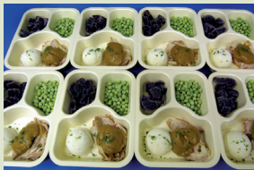
Meals are packaged in bio-degradable containers